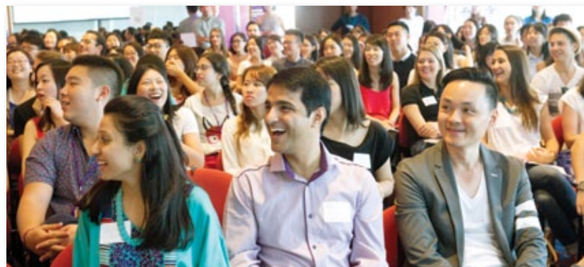
The International Student Support Center and the Office of Student Life co-hosted a “welcome luncheon” for our new incoming international graduate students in August. More than 450 students from 73 countries attended the event.