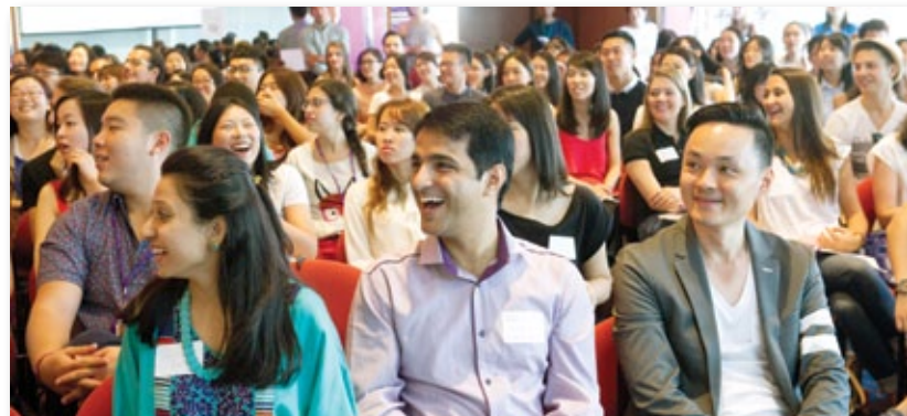
The International Student Support Center and the Office of Student Life co-hosted a “welcome luncheon” for our new incoming international graduate students in August. More than 450 students from 73 countries attended the event.