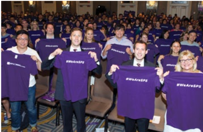
Students showed their school spirit during Graduate Orientation on August 31.

Students are getting the message out with a video that was specially created for Orientation and the initiation of Spirit Week. Take a look! bit.ly/WeAreSPS