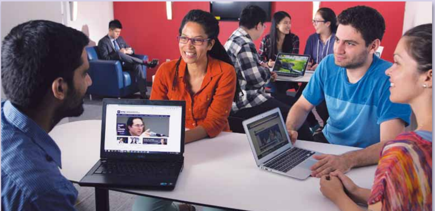
Students can take advantage of a number of resources at the NYU School of Professional Studies and the University at large.

This is just the beginning of your relationship with the NYU School of Professional Studies, which we hope will be rewarding, transformational, and lifelong.