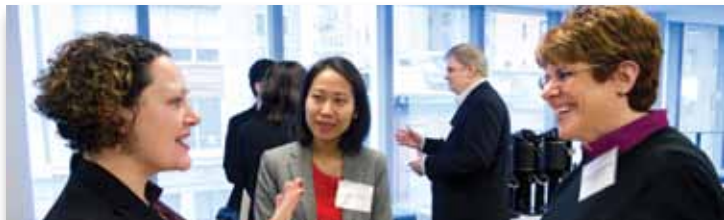
Students met with employers from the U.N.; Nielsen; Expedia, Inc.; Silverstein Properties, Inc.; and more to expand their professional network at the Wasserman Center Experienced Professionals Breakfast on March 6.