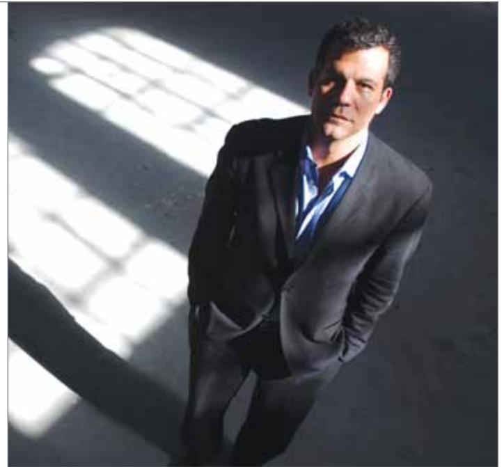
Richard Florida is one of the most sought-after public speakers in the world. Founder of The Creative Class Group, he is a regular contributor to CNN and senior editor for The Atlantic.