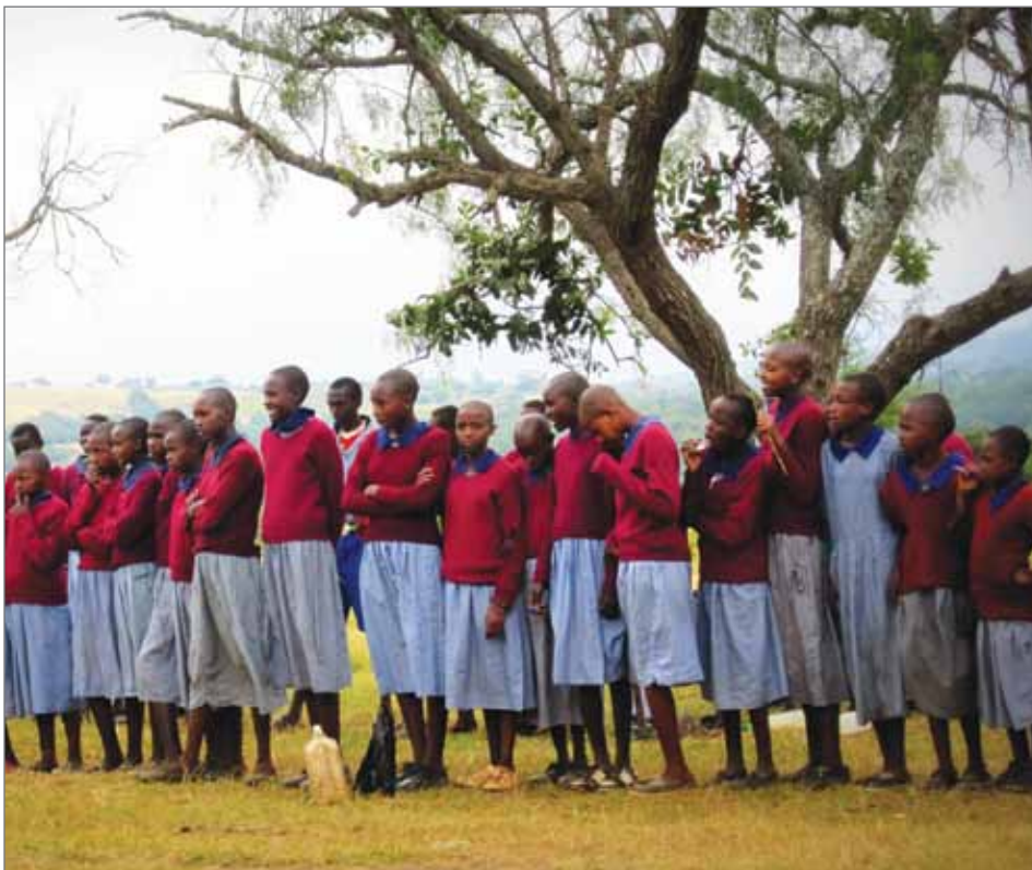
Maasai girls in their school uniforms in Kenya. Here, only 48 percent of girls enroll in school, and only 10 percent reach the high school level.

Through ongoing programs offered at an expanding number of global venues like Brazil Outreach, NYU Schack is uniquely equipped to provide its graduate students with the requisite knowledge and the skills to tackle the critical issues confronting the real estate and construction industries today, and moving forward. To learn more about NYU Schack's global initiatives, visit scps.nyu.edu/schack/globalinitiatives ♦