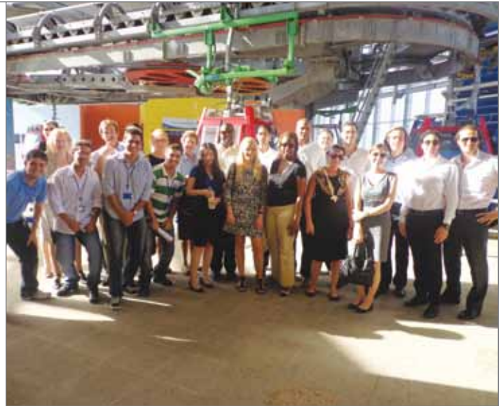
A group of NYU Schack students, faculty members, and administrators visit a public cable car/transport project connecting Rio favelas - with Odebrecht.