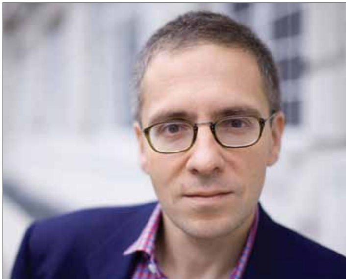
Ian Bremmer, president of Eurasia Group and expert on global macro political trends and emerging markets.