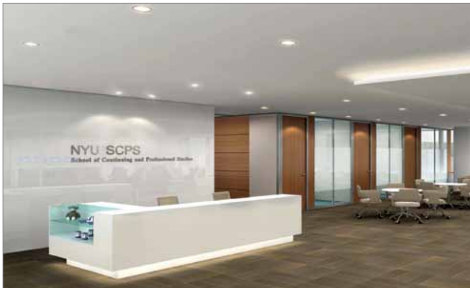
A rendering of the new NYU-SCPS ALI Tokyo Center, which will open this coming October.

NYU-SCPS and Nichii Gakkan Company entered into a collaboration and a service agreement to open the New York University School of Continuing and Professional Studies American Language Institute Tokyo Center (NYU-SCPS ALI Tokyo Center).