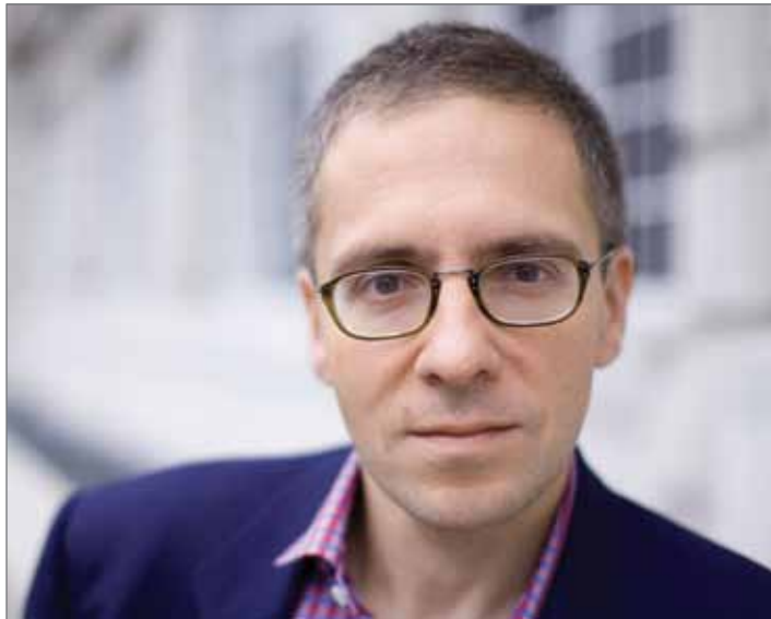
Ian Bremmer, president of Eurasia Group and expert on global macro political trends and emerging markets.